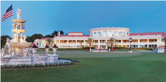
Trump National Doral, Miami.