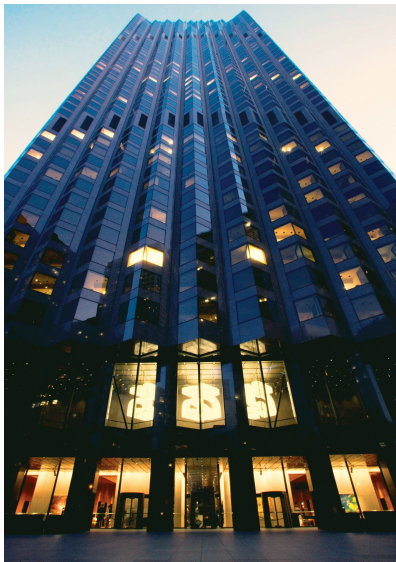
The Bank of America Building, San Francisco.