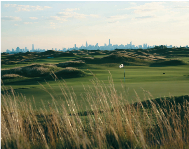
Trump Golf Links at Ferry Point.