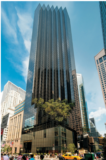
Trump Tower, adjoining Tiffany's (whose air rights I purchased), between 56th Street and 57th Street on Fifth Avenue.