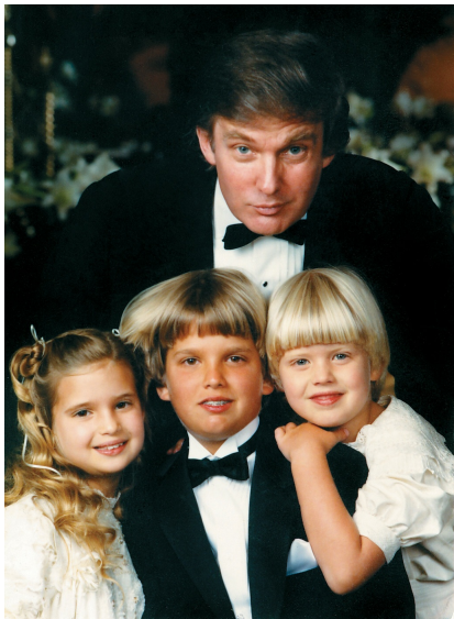
With Ivanka, Don, and Eric.