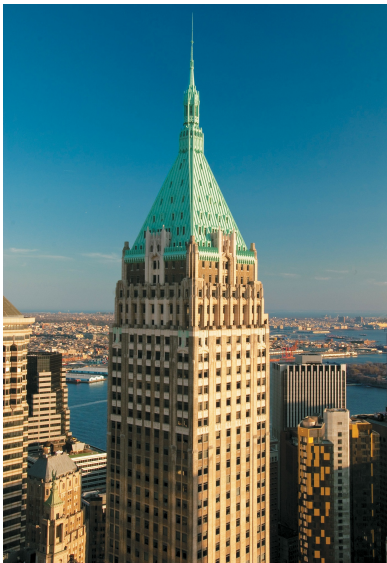
The Trump Building at 40 Wall Street opposite the New York Stock Exchange.