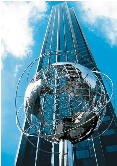
Trump International Hotel & Tower, One Central Park West.