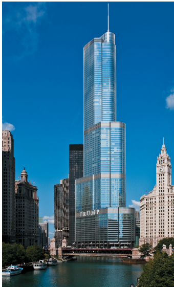
Trump International Hotel & Tower on the river in Chicago.