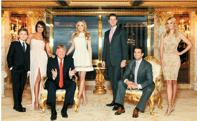
My wonderful family.