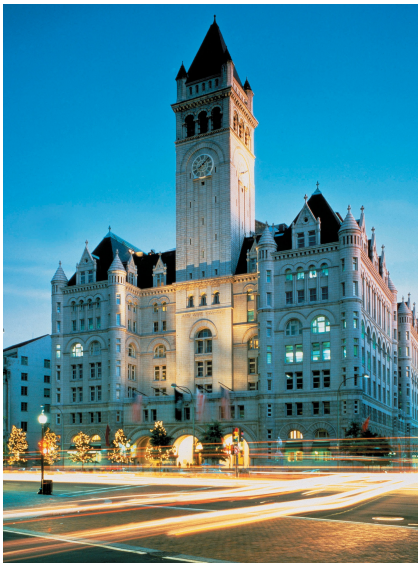
Trump International Hotel on Pennsylvania Avenue in Washington DC, under construction. Formerly this was the Old Post Office.