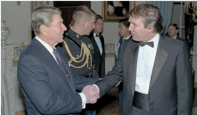
With President Ronald Reagan, a great guy , at the White House.