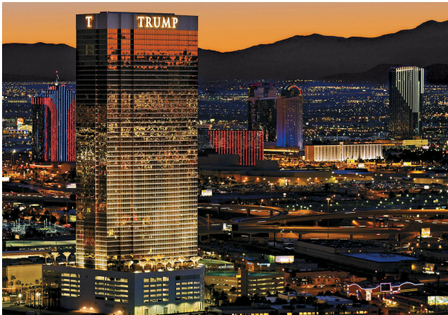
Trump International Hotel in Las Vegas—Las Vegas's tallest building.