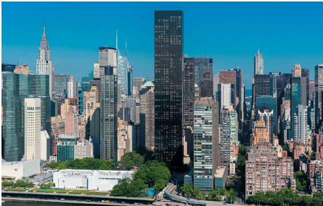
Trump World Tower—90 stories, opposite the United Nations.