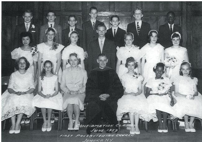
At my confirmation—First Presbyterian Church, Jamaica, New York. I'm top row, second from the right.